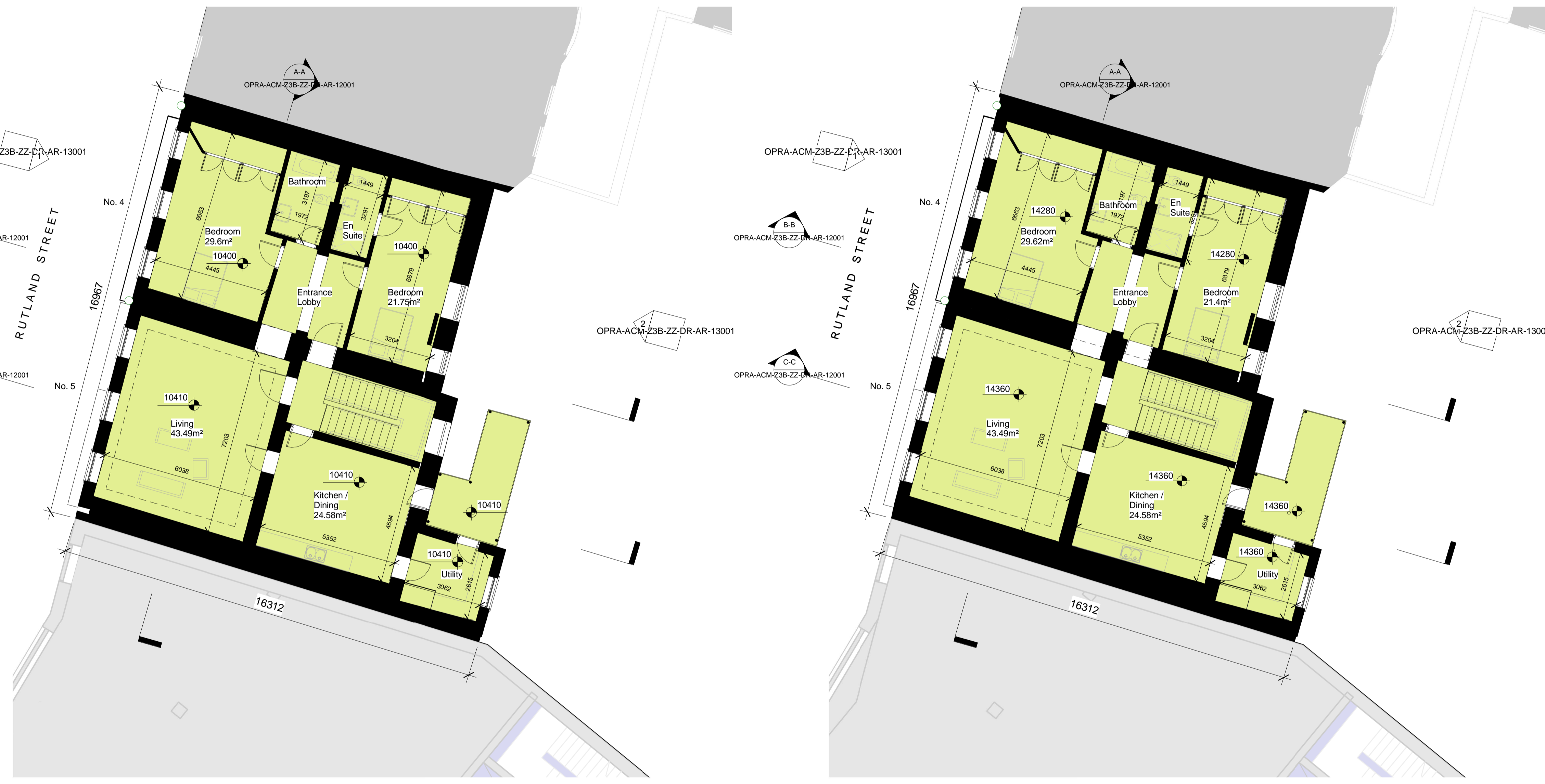
1 Proposed First Floor Plan